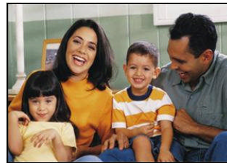
Free tax preparation for Napa County families!

Staffed by volunteers from financial institutions throughout Napa County, VITA